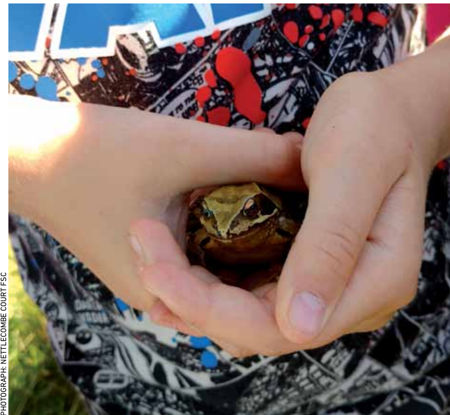
PHOTOGRAPH: NETTLECOMBE COURT FSC

“ It has opened up education. Pupils are keen to relate their activities outdoors with enthusiasm