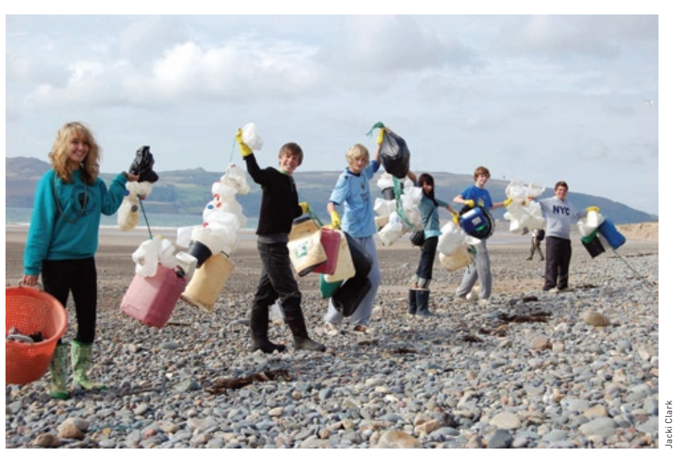
Beech Hall School, Cheshire

"Most of them never knew this [Peak District National Park] existed. They are asking how to take their parents back..." (Provider working with refugees).