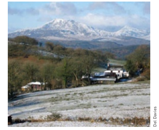
Bryn Beddau, North Wales

We look forward to continued growth, and the opportunity of inspiring people of all ages to care and take responsibility for the wild land and wild places of Wales.