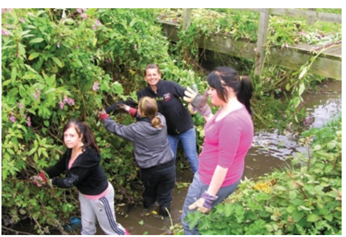
Pennywell Youth Project

continuing efforts to transform this area into a haven for all types of native wildlife.